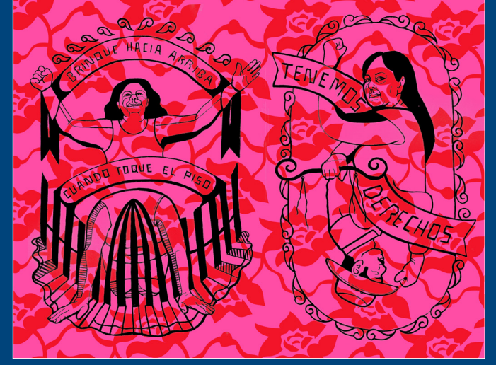
Nansi Guevara, Muxeres lideres de Brownsville, Texas, 2016, print, 24" x 18". See more of Nansi's work at: nansiguevara.com.

Your support makes The Public Eye possible. Subscribe and donate today!