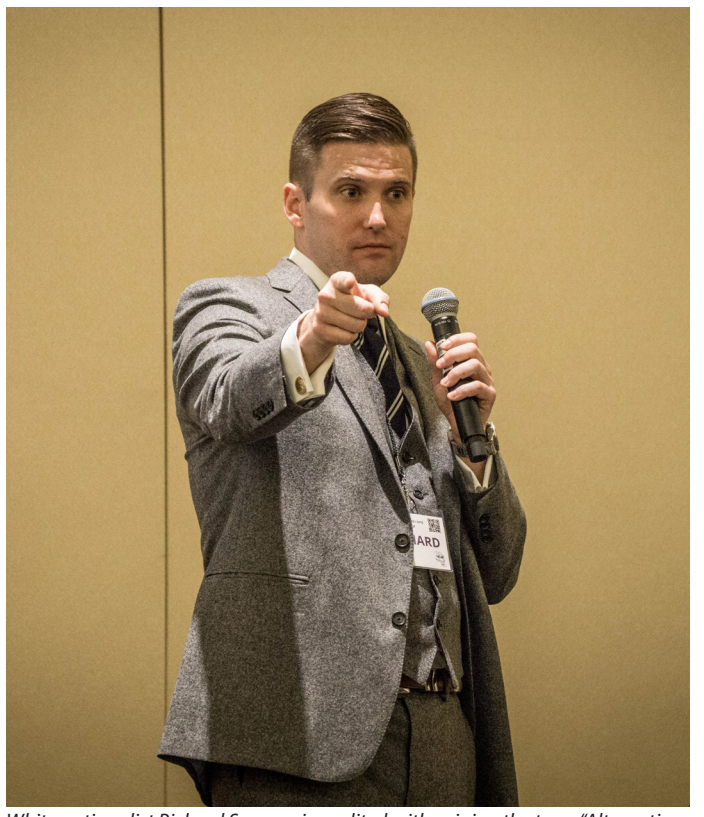
White nationalist Richard Spencer is credited with coining the term "Alternative Right" in 2009.

ism" conspiracy to destrov Western civilization. But what was once an idea with limited popular appeal was gaining widespread circulation through popular conspiracists like Alex Jones, creator of the massively popular conspiracy mill InfoWars. At 4chan and 8chan. the threat of "Cultural Marxism" became the focal point of many discussions, first about Gamergate, then, increasingly, politics. A common theme began to emerge: that White men were being systematically oppressed by dangerous left-wing forces, and that mainstream conser-