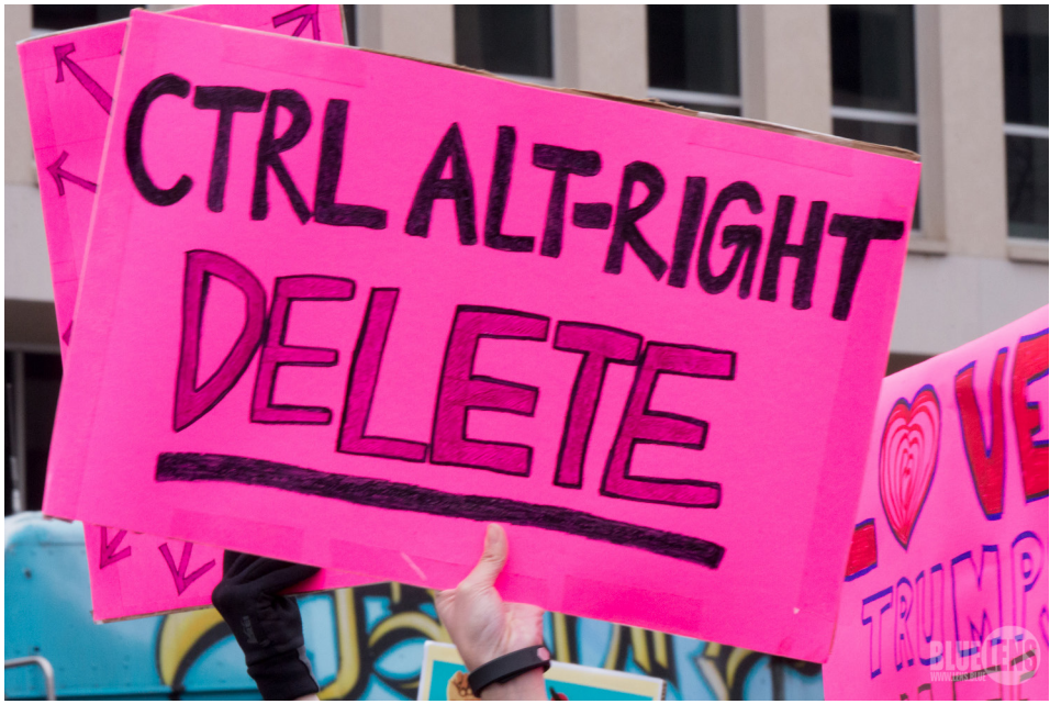
A sign at the 2017 Women's March on Washington, D.C.

White nationalism quickly devolved from its original claim—to be simply promoting the interests of ethnic Whites—to, by the late '90s, demonizing non-Whites and LGBTQ people, as well as embracing far-right undercurrents of antisemitism and conspiracism. And indeed, many of the movement's leaders displayed the kind of personal-