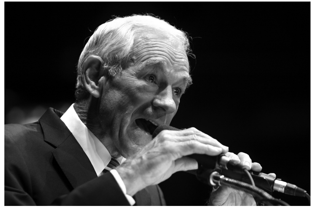
Ron Paul addressing a crowd in Florida in 2012.

Behind the recent surge of nullification bills in state legislatures there is an ongoing battle for the soul of the GOP—and the future of the union itself. The nullification movement's ideology is rooted in reverence for states' rights and a theocratic and neo-Confederate interpretation of U.S. history. Ron Paul, who is often portrayed as a libertarian, is the engine behind the movement.