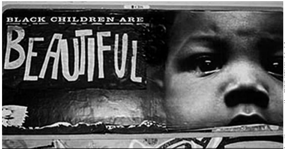
One of the Georgia “Black Children Are an Endangered Species” billboards, “corrected” by activists.

Recent studies by the Guttmacher Institute found that abortion rates are indeed higher among women of color. 3 African Americans, in particular, are thirteen percent of the population but account for 37 percent of all abortions. However, Guttmacher determined, this is due to their greater incidence of unwanted pregnancies, resulting from economic inequality and poor access to contraception and education. Nonetheless, the anti-abortion