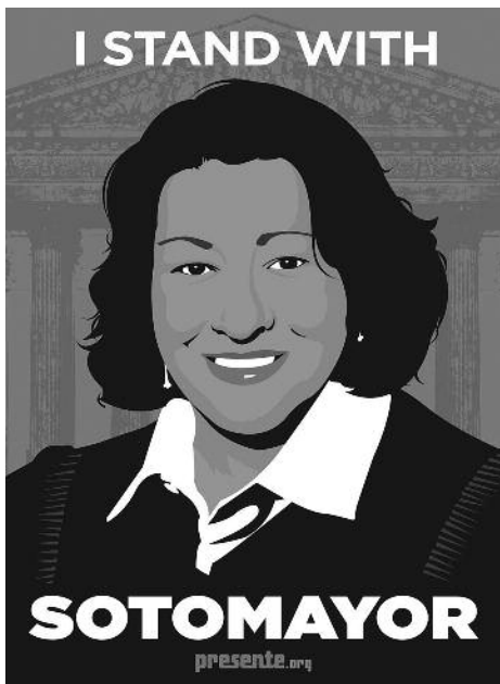
Presente.org pro-Sotomayor poster

Are grassroots campaigns like Basta Dobbs and comprehensive immigration reform complementary, or are they pulling the immigrant-rights movement in different strategic directions?