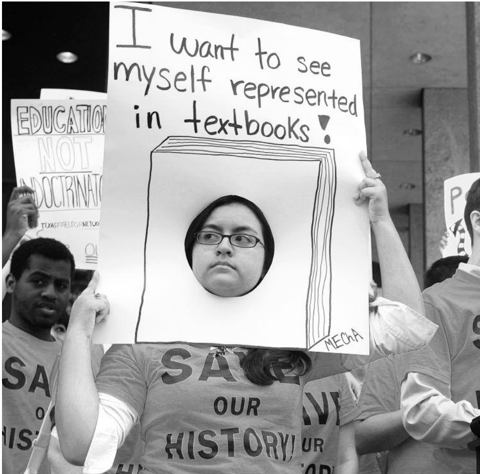
Students rally at a State Board of Education meeting, Austin, Texas, March 10, 2010