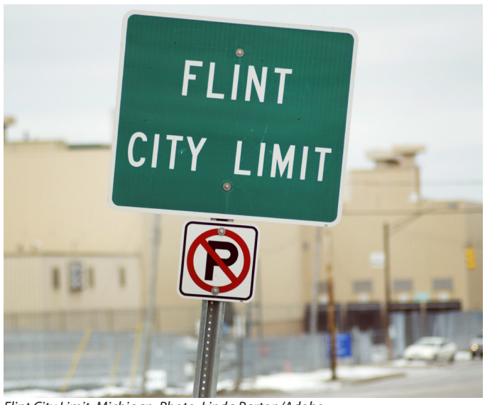
Flint City Limit, Michigan.

It's not by chance that the U.S. is full of hollowed-out urban centers. Residents are disproportionately poor and people of color, surrounded by wealthier and Whiter suburbs. It traces back to the Great Migration, which brought great numbers of African Americans to segregated cities and pushed the "separate but equal" doctrine to its limit.<sup>3</sup> Follow-