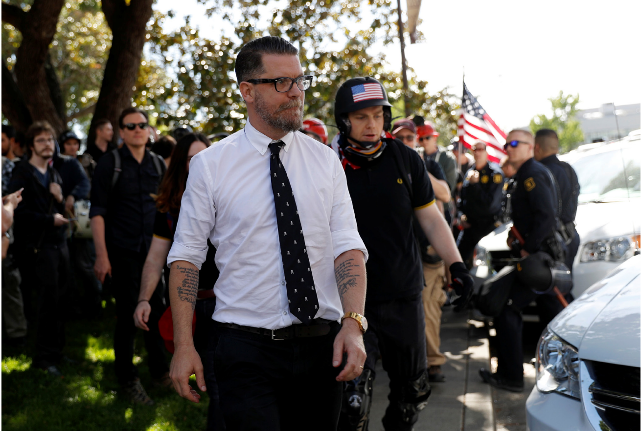
Gavin McInnes with a group of protesters after giving a speech at the University of California, Berkeley, April 27, 2017.