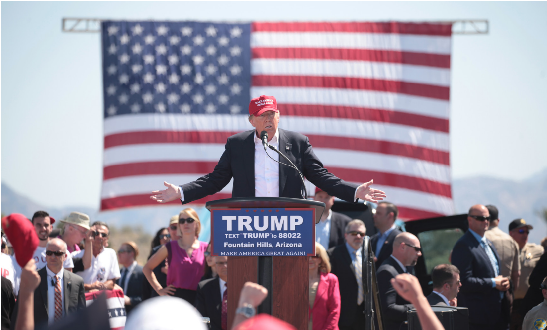
Donald Trump speaks at an Arizona rally in March 2016.

How to Understand Changes on the Political Right