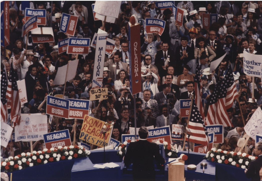
Ronald Reagan gives his acceptance speech at the Republican National Convention, July 1980.

focus on abortion would help move some Catholics into the Republic fold. The group agreed to help Falwell establish a non-profit, tax-exempt organization called the Moral Majority so he could reach a larger audience. The meeting served its purpose. Fifty-six percent of White Baptists supported Carter in 1976; only 34 percent did in 1980. 17