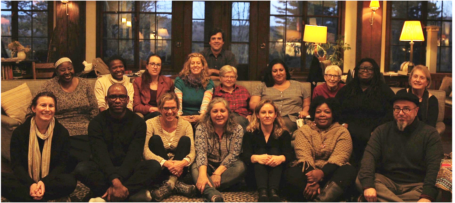
Blue Mountain Center convening participants, November 2018.