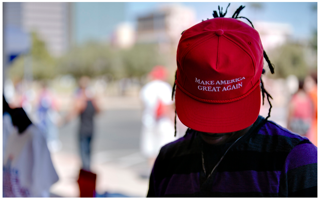
A Black Trump supporter at an Arizona rally in 2016.

Multiracial Organizing on the Contemporary Far Right