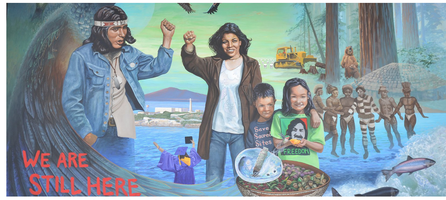
Native American Community Mural in the Cesar Chavez Student Center Building, San Francisco State University, San Francisco, CA.

Tribes.<sup>33</sup> In a 2017 challenge to ICWA, the Supreme Court upheld this interpretation.<sup>34</sup>