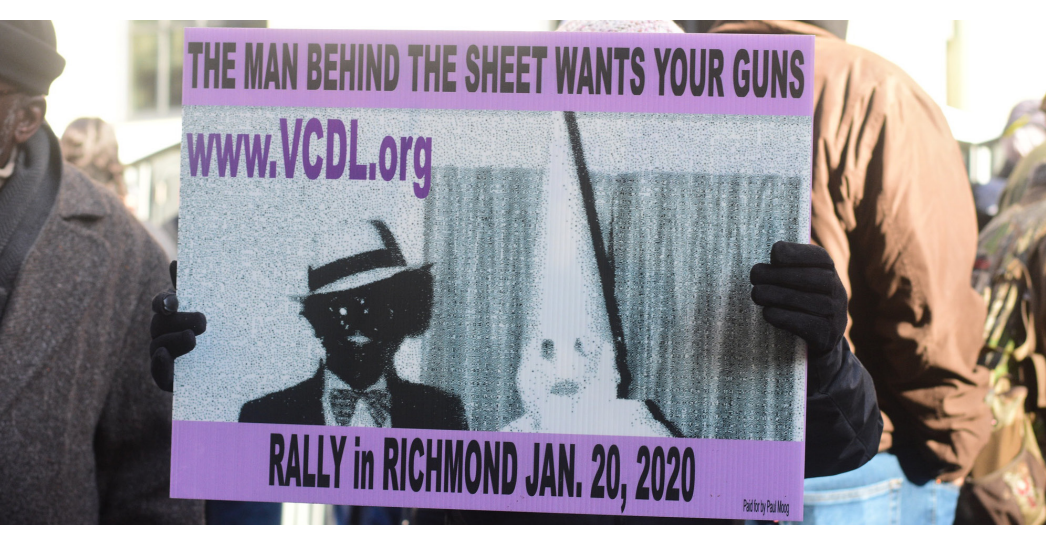
Virgina Second Amendment Rally, January 2020.

Some militia groups explicitly embraced and "promoted blatant racism" and others "directly confronted or harassed White nationalist organizations such as the KKK."