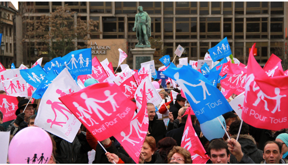
Demonstration against marriage equality in Strasbourg, France, February 2013.

the same time, they benefited from the French Catholic Church's largess and infrastructure, which helped when it came time to organizing protests against marriage equality. While public opinion in France is strong for same-sex marriage, LMPT was able to capitalize on widespread discomfort with same-sex parenting to generate a moral panic around concerns for children, same-sex adoption, artificial insemination, and surrogacy.<sup>13</sup>