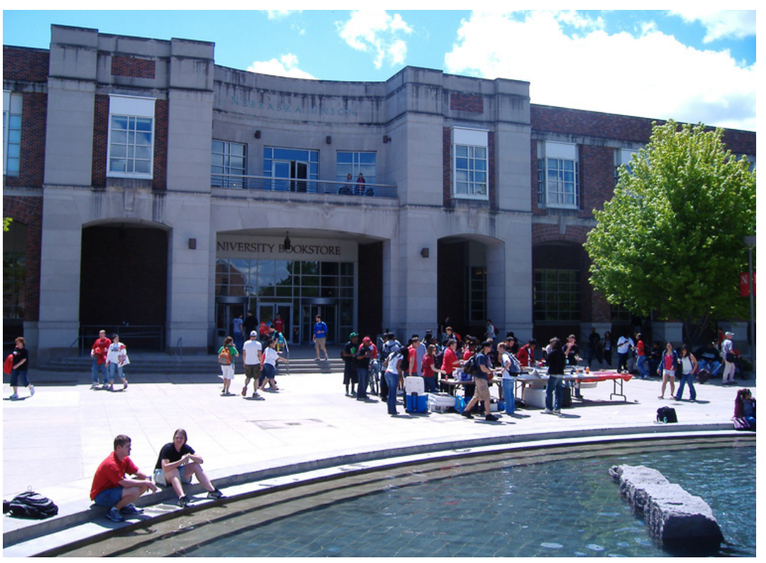
Nebraska Union of the University of Nebraska-Lincoln.

Other universities denounce threats of violence but bury the lede. When Trin-