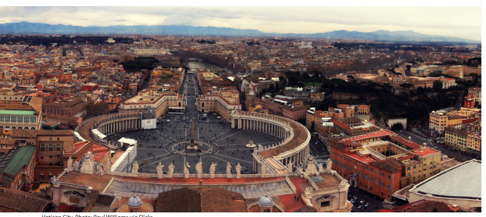
Vatican City.

Just as U.S. evangelicals worked with politicians in Uganda on the "Kill the Gays" bill,5 the Vatican and its clergy have strongly influenced African antisexual and -gender rights legislation. In 2016, for example, several Roman Cath-