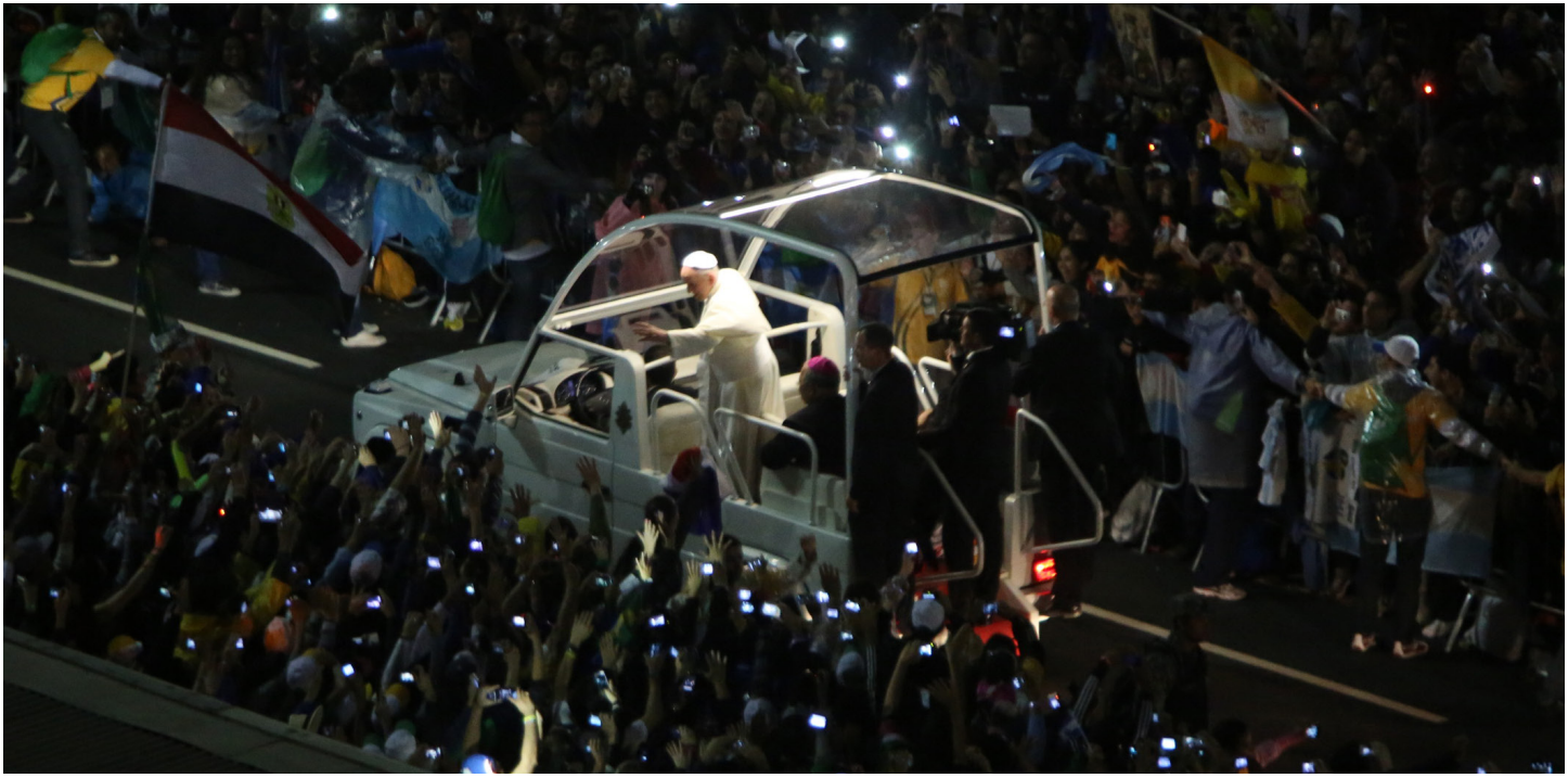
Pope Francis arrives at Copacabana beach for a welcoming ceremony for World Youth Day 2013 in Rio de Janeiro, Brazil.

How the Vatican's Position on Gender Threatens Human Rights