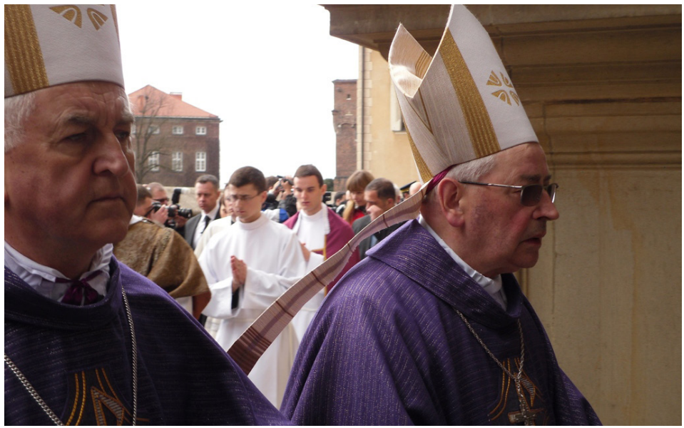
Bishop Tadeusz Pieronek in Krakow, 2011.

Bishop Pieronek's suggestion that "gender" was yet another foreign ideological threat to Poland found a captive audience in a population traumatized by decades of totalitarian rule.