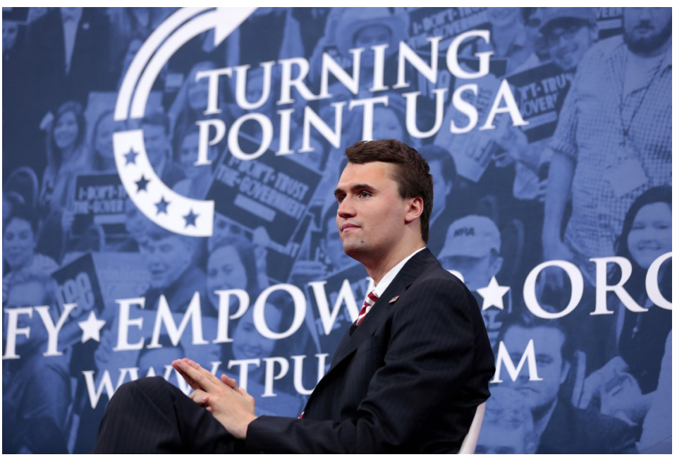
Charlie Kirk (founder of TPUSA) speaking at the 2018 Conservative Political Action Conference (CPAC) in National Harbor, Maryland.

Academia is often stereotyped as a haven for liberal professors, but it houses