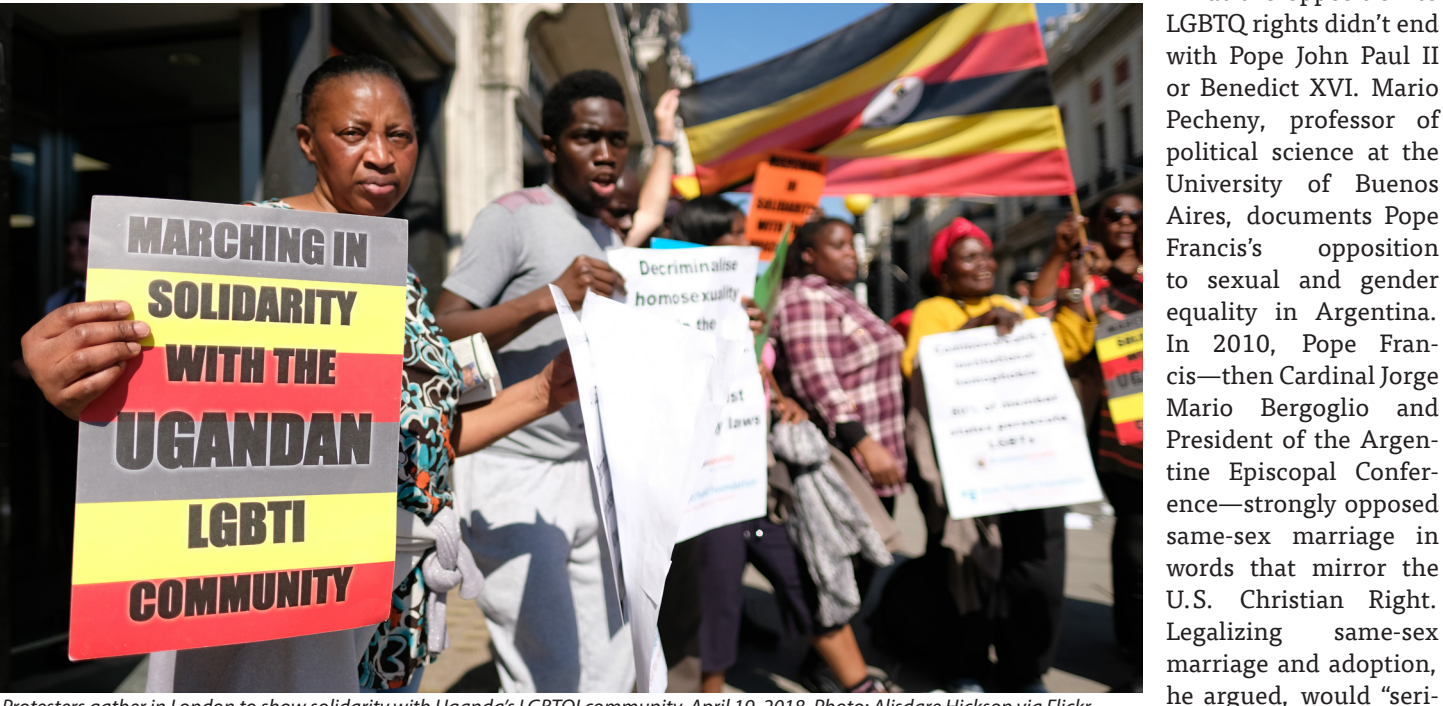
Protesters gather in London to show solidarity with Uganda's LGBTQI community, April 19, 2018.

denying a biological truth and produced by a powerful lobby."19