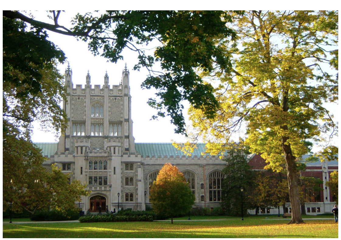
Thompson Library at Vassar College in Poughkeepsie, New York.