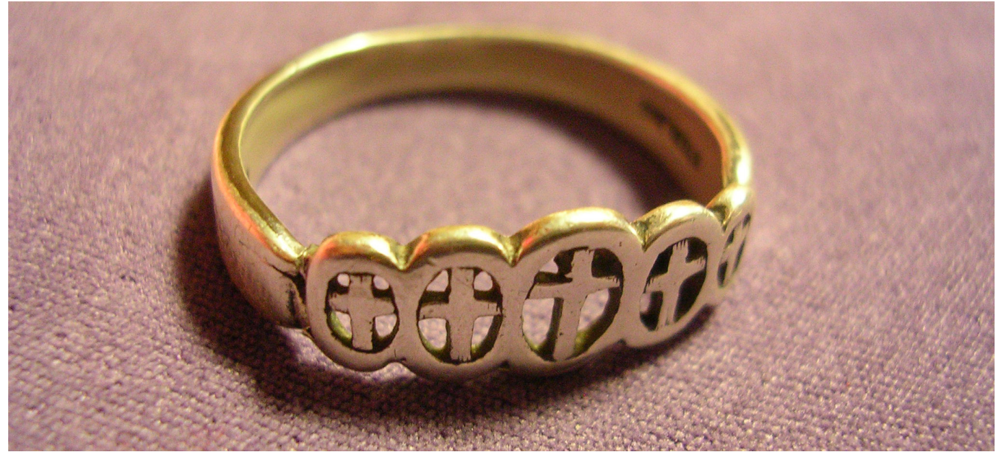
Purity Ring.

vangelical "purity" culture, roughly defined, is the belief that Christianity requires sexual abstinence before (heterosexual) marriage, especially for girls and women, and promises sexual fulfillment to those who save sex until marriage. It's a belief system often accompanied by messages of shame for those who fail to remain virgins until their wedding day—who are not only said to be breaking God's law but risking lifelong consequences for their sexual "sins."