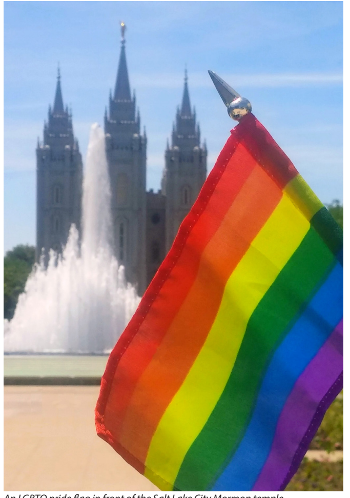
An LGBTQ pride flag in front of the Salt Lake City Mormon temple.

Orleans, and though that church's pastor helped lead my father into fundamentalism, I still think that experience has been meaningful to me as a White woman. There were some really good things mixed in with the bad, such as an exposure to Black liberation theology. For a lot of people, church is the closest thing they'll get to therapy for trauma