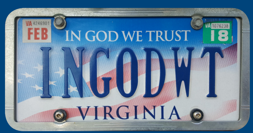
"In God We Trust" license plates are already available in 20 states and in some the phrase will appear on every license plate.

mining equality. In response, PRA is helping anchor the monitoring project BlitzWatch, along with a coalition of national organizations committed to protecting equality and human rights. Visit www.blitzwatch.org to learn more.