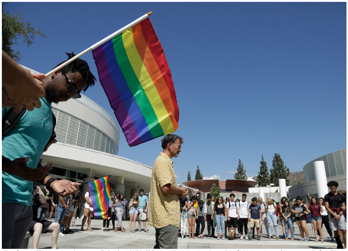
A professor offers a prayer during a rally by the LGBTQ Christian community at Azusa Pacific University to show support after the school reinstated a ban on same-sex relationships, October 1, 2018.