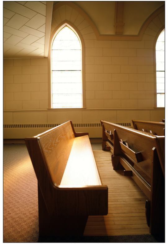
Church pew.

Although I was successful at leading women, teen girls, and singles, I began to notice some disconcerting things. By 2015, during the election cycle, my nagging doubts reach a zenith. I was leading a women's group at the largest Baptist church in Clearwater, Florida, where, except for me, all the members were White. The women in my group seemed lost, depressed,