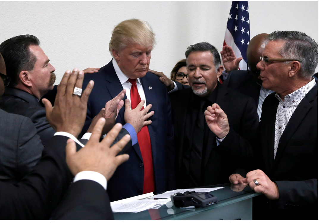
Donald Trump prays with pastors during a campaign visit in Las Vegas, Nevada, October 5, 2016.

teenager, I decided that God was terrible for allowing women to be treated the way they were in the Bible—particularly the gang rape and murder of the concubine in the Book of Judges. I rebelled against the wholly domestic role for women that I'd been taught and left home at age 17 to escape ongoing violence based largely on the Christian childrearing manual To Train Up a Child.