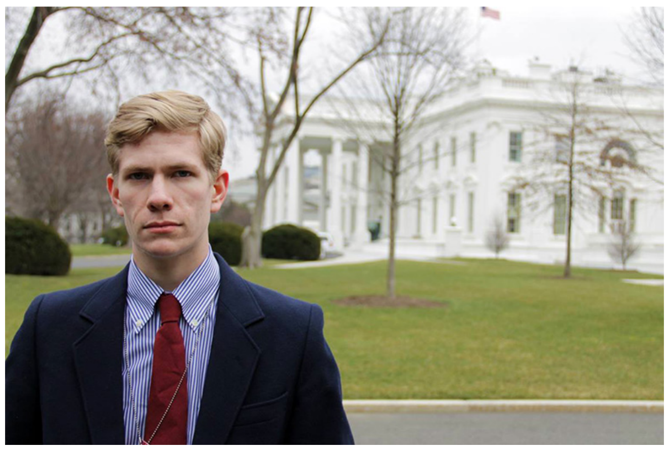
Mike Mahoney, aka Mike Ma, still in his twenties, has built up a significant following on social media for his specific brand of violent, accelerationist farright environmentalism.

e're the virus." So read a popular tweet from mid-March praising reports of diminished air and water pollution in countries under lockdown due to the novel coronavirus COVID-19. By mid-April, the tweet, which also suggested that "Coronavirus is Earth's vaccine," was liked nearly 300,000 times.