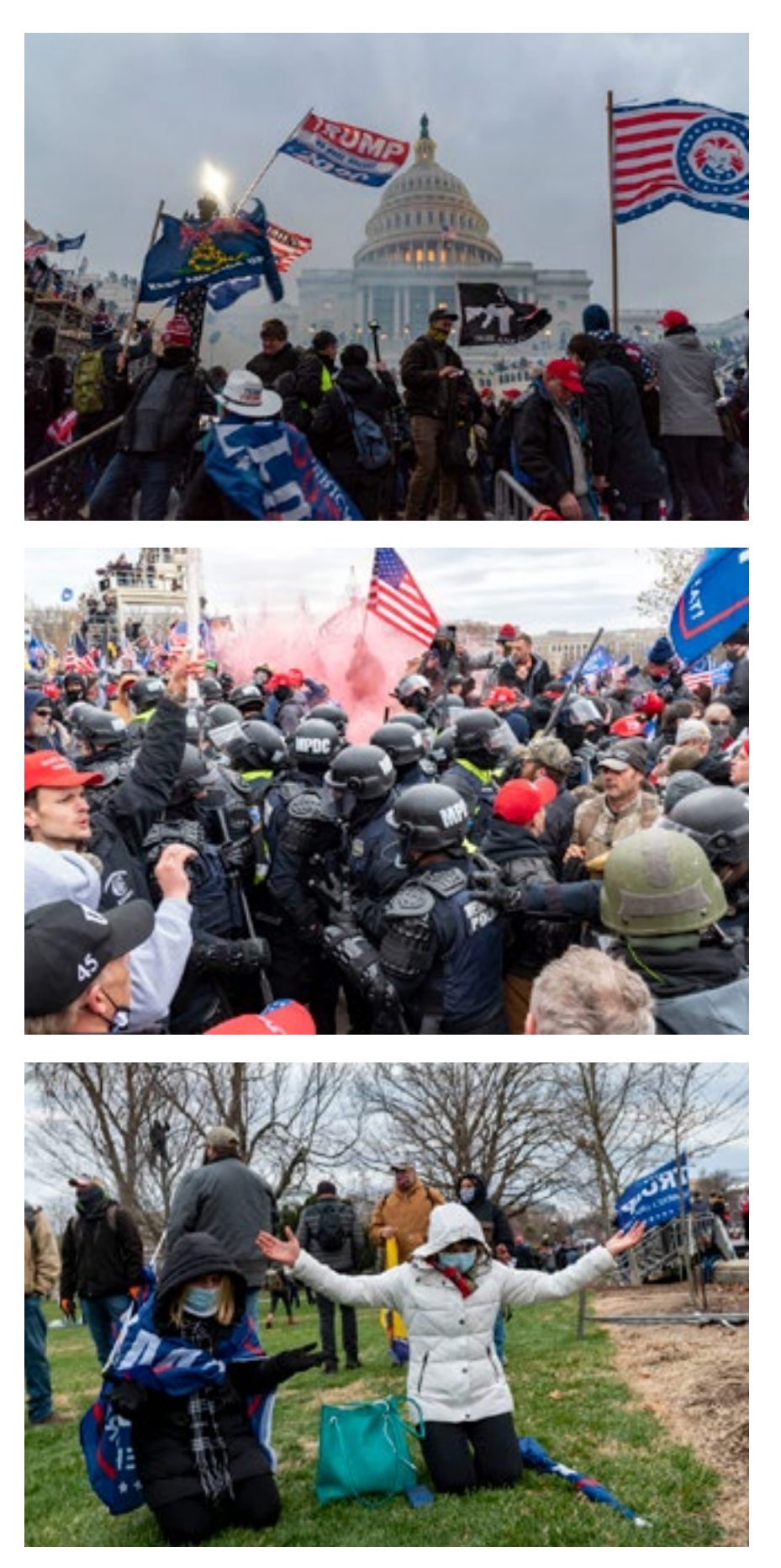
Snapshots from the insurrection at the U.S Capitol on January 6, 2021.